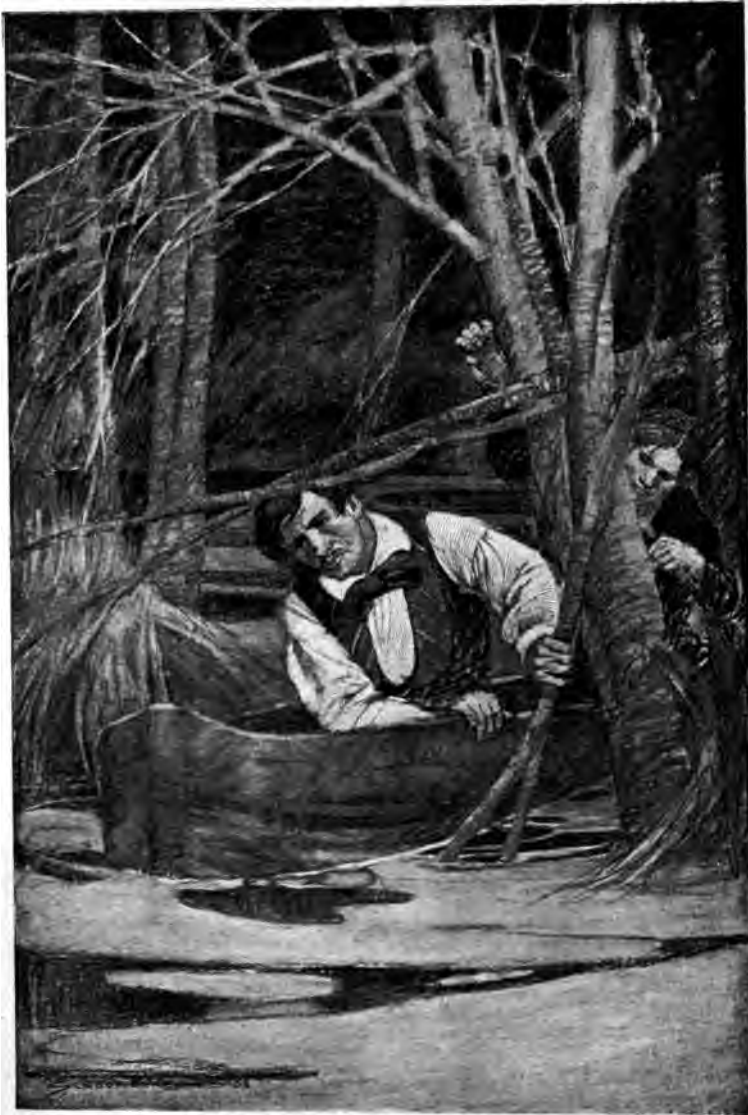
Neil forced the dugout through the water.— Page 142